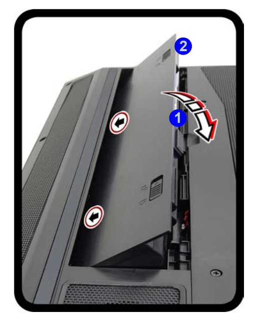
Figure 3 - 18 Battery Insertion