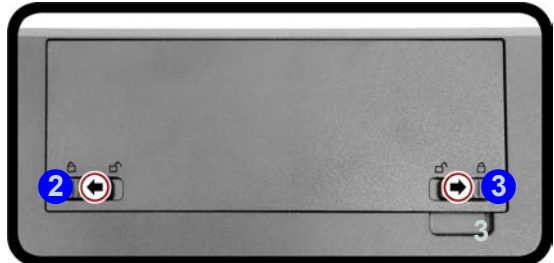
Figure 3 - 17 Battery Insertion